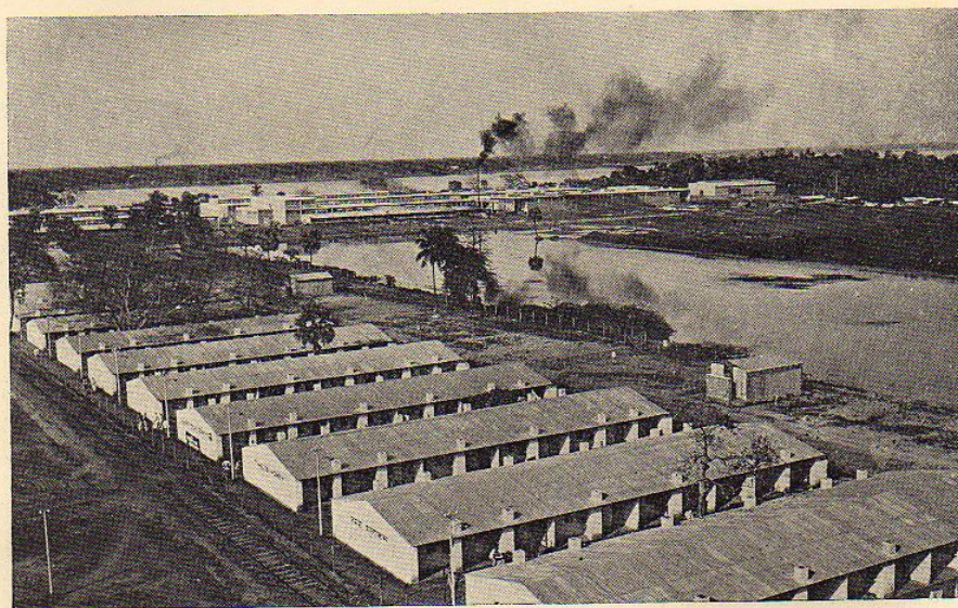
Indie pracující. Nahoře: Prodejna Bata Chowringhe, Calcuta. Dole: V popředí ulice rodinné čtvrti indických spolupracovníků, v pozadí budovy dílen.